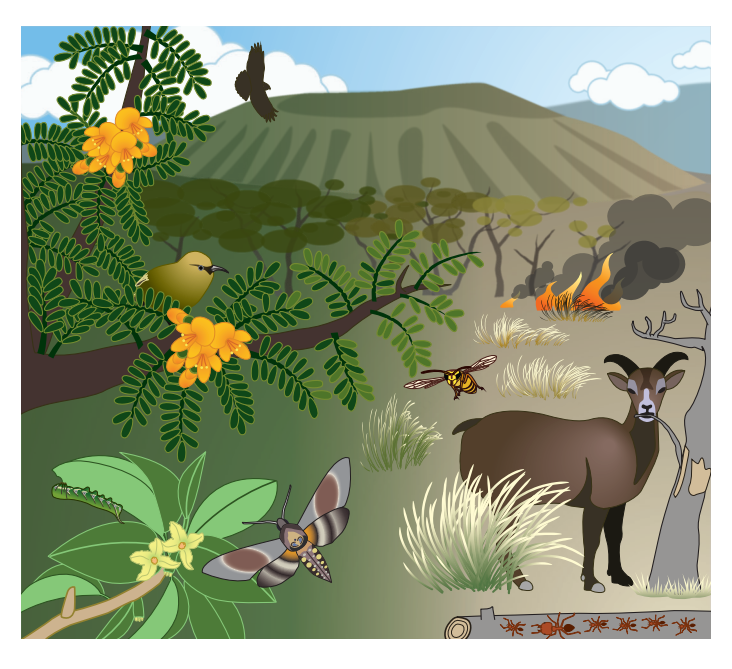
Figure 1: Native dominated ecosystems at Pu'u Wa'awa'a (above, left) can be impacted during drought events in several ways (above, right), including: increased incidence of wildfire, increased growth of non-native shrubs and grasses, and increased activity of invasive insects and mammals which all lead to habitat loss for the area's native species. Non-native hoofed mammals, such as the feral goat (above, right), increase their foraging on native plants during drought. These animals can significantly reduce the survival of native trees by trampling, bark stripping, and browsing.

The term "drought" is generally used to describe a prolonged period with less-than-average amounts of rain in a particular area. A lack of rainfall can reduce soil moisture or groundwater, reduce stream flow, and cause water shortages. Low rainfall can also be associated with higher-than-average temperatures and reduced cloud cover. An individual drought event may last for weeks, months, or even years and the severity of a drought will depend on how long the area receives below-average rainfall. Hot temperatures can make droughts worse by evaporating moisture from the soil. Drought can also create environmental conditions that lead to wildland