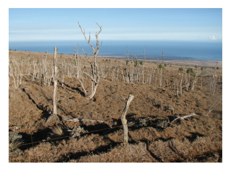
Figure 4: Dead kikuyu grass (died from the drought), and dead māmane trees (likely killed by a combination of drought, pests, and competition with weeds, etc.), this photo was taken in October, 2010, in the southwest part of Pu'u Wa'awa'a (Elevation 3583 ft.) following 21 consecutive months of below average rainfall.

Severe droughts can reduce species populations and sometimes be the key factor driving extinction. The risk of wildfire occurrence is also increased during times of drought which may cause managers to close parts of Pu'u Wa'awa'a to visitors to avoid ignitions. Wildfire can lead to other ecological consequences, including higher rates of erosion from burned areas. Reducing invasive fire prone vegetation such as fountain grass, is an important and essential action that managers can take to mitigate drought effects on wildfire risk. One strategy for forest restoration is to plant drought tolerant native tree species in sites heavily impacted by drought (Figure 4). Effective management can reduce alien species invasion, and the frequency and severity of disturbances such as wildfire during periods of drought.